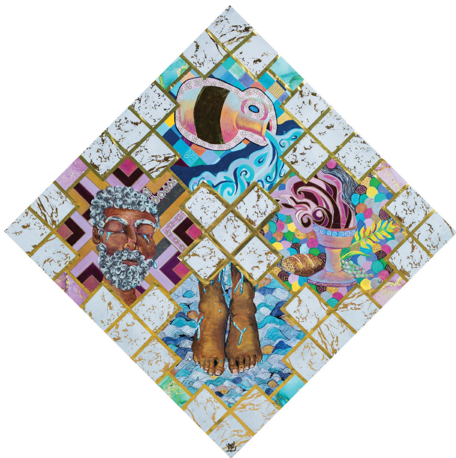
Golden Hour | Rev. Nicolette Peñaranda Acrylic, ink, paper collage, yarn, metallic tape, and mixed media on canvas