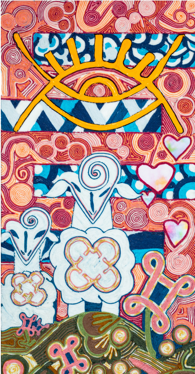
Feed My Sheep | Nicolette Peñaranda Yarn and paper collage on canvas